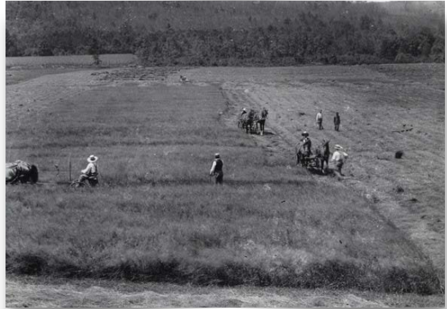
"View of Men and Horses in Field Harvesting, Enfield, MA,"

June 27, 1926 Prescott -- The heated tem[erature] that we have to expect every summer despite all prophesies to the contrary struck us last week with full force. Close to the century mark was the rule for several days and it was a most uncomfortable week altogether.