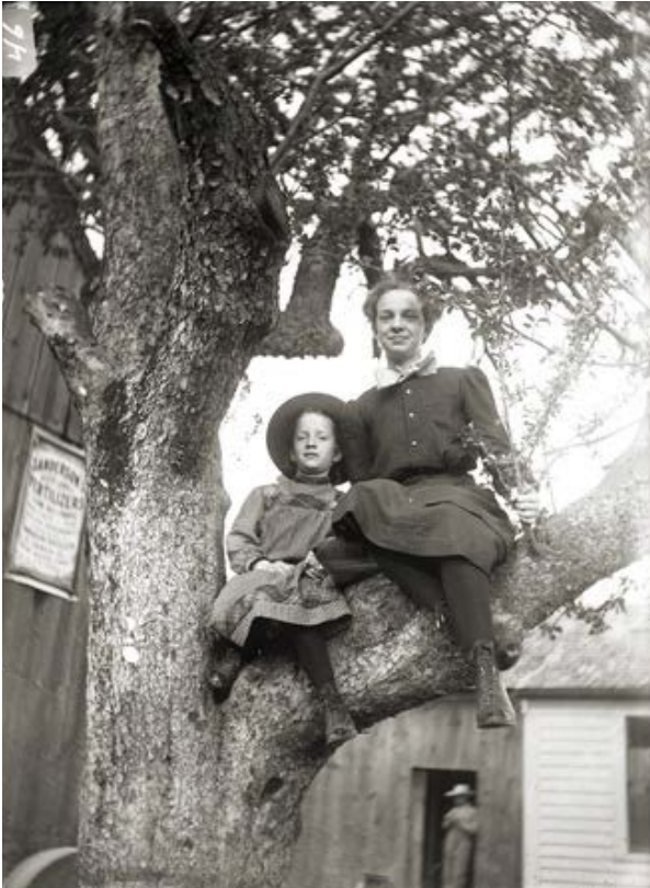
Young woman and child in a tree (Greenwich, Mass.), ca. 1910.